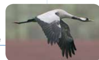
Eurasian Crane, Photo: Steve Garvie